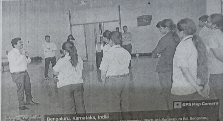
Bengaluru, Karnataka, India K S School Of Engineering And Management Engineering Block, off, Kanakapura Rd, Bengaluru, Mallasandra, Karnataka 560109, India Lat 12.859652° Long 77.543045° 08/08/24 11:57 AM GMT +05:30