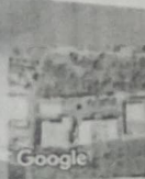
Bengaluru, Karnataka, India K. S. School Of Engineering And Management Engineering Block, off, Kanakapura Rd, Bengaluru, Mallasandra, Karnataka 560109, India Lat 12.859652° Long 77.843045° 08/08/24 11:50 AM GMT +05:30