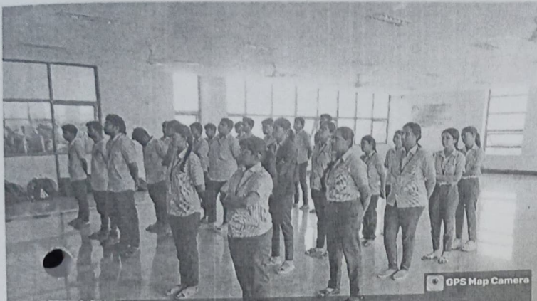
Bengaluru, Karnataka, India K S School Of Engineering And Management Engineering Block, off, Kanakapura Rd, Bengaluru, Mallasandra, Karnataka 560109, India Lat 12.859652° Long 77.543045° 08/08/24 11:52 AM GMT +05:30