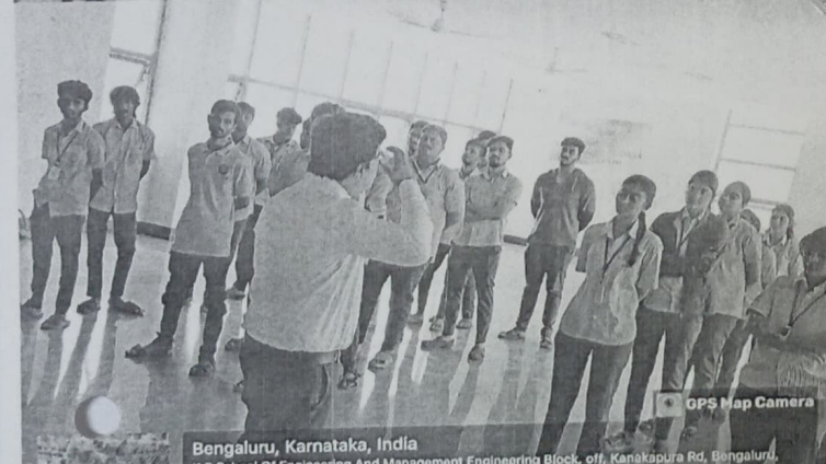
Bengaluru, Karnataka, India K S School Of Engineering And Management Engineering Block, off, Kanakapura Rd, Bengaluru, Mallasandra, Karnataka 560109, India Lat 12.859652° Long 77.543045° 08/08/24 11:59 AM GMT +05:30