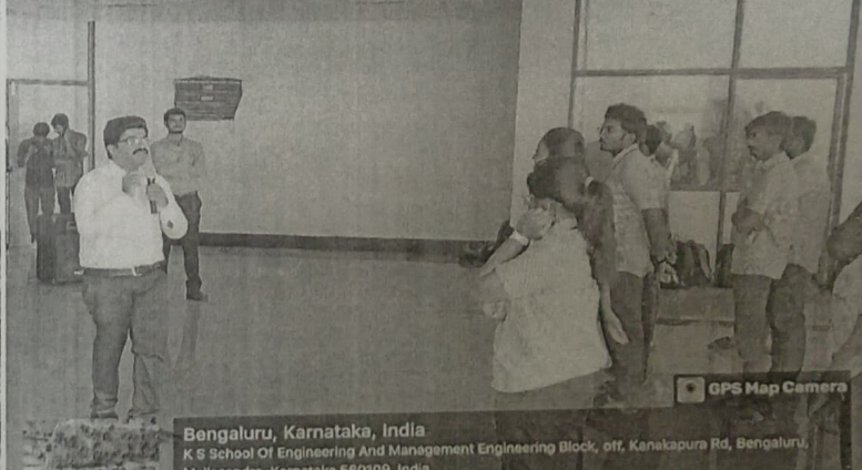
Bengaluru, Karnataka, India K S School Of Engineering And Management Engineering Block, off, Kanakapura Rd, Bengaluru, Mallasandra, Karnataka 560109, India Lat 12.859652° Long 77.543045° 08/08/24 11:57 AM GMT +05:30

I would like to extend my gratitude to our Management, CEO, and Principal for their generous support and financial assistance, which allowed us to organize the activity seamlessly.