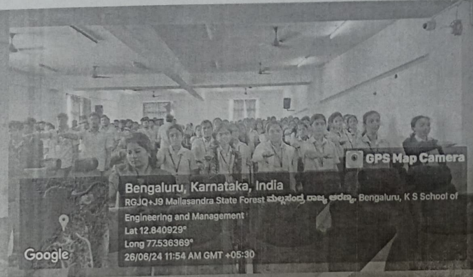
Bengaluru, Karnataka, India RGJQ+J9 Mallasandra State Forest Bengaluru, Karnataka, Bengaluru, K S School of Engineering and Management Lat 12.840929° Long 77.536369° 26/06/24 11:54 AM GMT +05:30