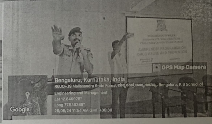
Bengaluru, Karnataka, India RGJQ+J9 Mallasandra State Forest Bengaluru, Karnataka, Bengaluru, K S School of Engineering and Management Lat 12.840929° Long 77.536369° 26/06/24 11:54 AM GMT +05:30

I would like to extend my gratitude to our Management, CEO, Principal and Head of all the Departments for their generous support, which allowed us to organize the activity seamlessly.