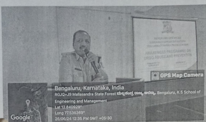
Bengaluru, Karnataka, India RGJQ+J9 Mallasandra State Forest Bengaluru, Karnataka, Bengaluru, K S School of Engineering and Management Lat 12.840929° Long 77.536369° 26/06/24 12:35 PM GMT +05:30

Approved by AICTE, New Delhi; Affiliated to VTU, Belagavi, Karnataka; Accredited by NAAC #15, Near Vajarahalli, Mallasandra, off kanakapura Road, Bengaluru – 560109 Tel: +91 8028425012/013/163, Fax: +91 80 28425164, Mob: 88844444408 / 9606055906 www.kssem.edu.in