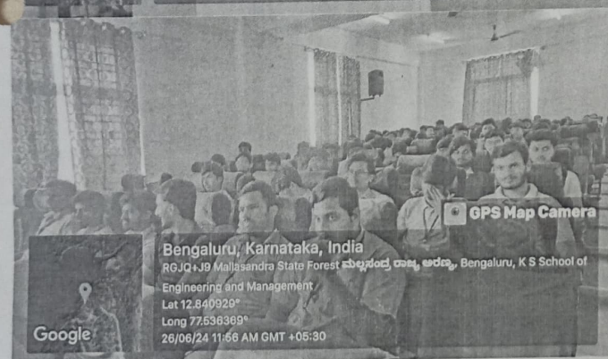
Bengaluru, Karnataka, India RGJQ+J9 Mallasandra State Forest Bengaluru, Karnataka, Bengaluru, K S School of Engineering and Management Lat 12.840929° Long 77.536369° 26/06/24 11:56 AM GMT +05:30