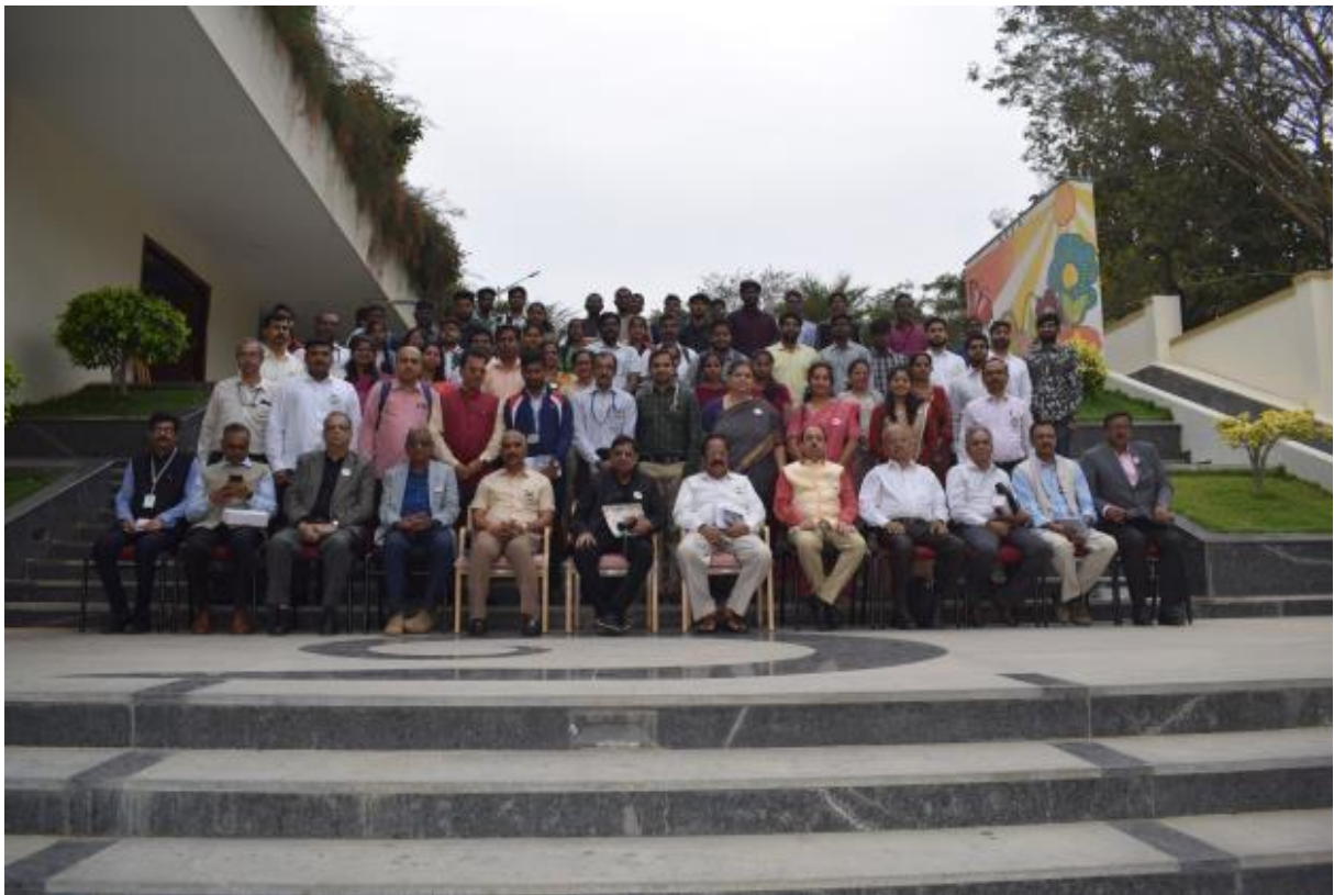
GROUP PHOTO WITH PARTICIPANTS