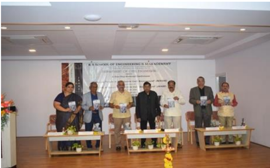
UNVEILING OF BOOK OF ABSTRACTS