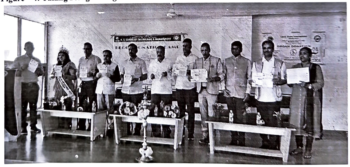
Figure – 4: Organ Donation Pledge.