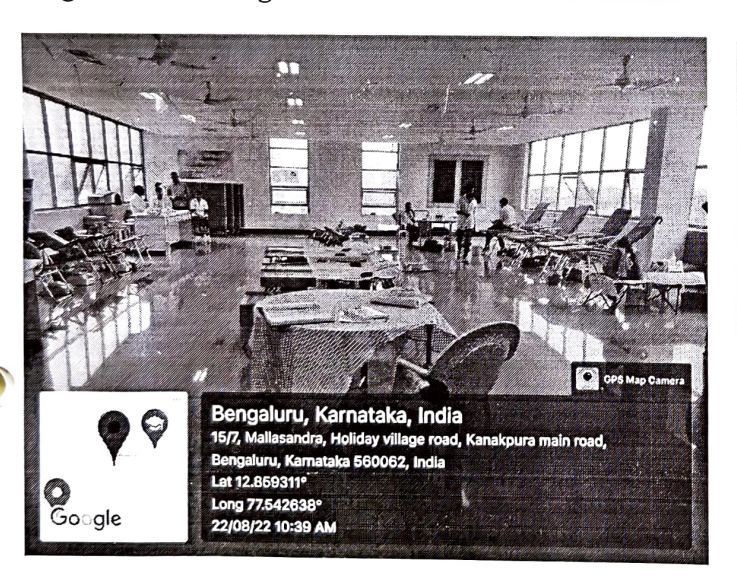
Figure – 2: Arrangements Done for blood donation.