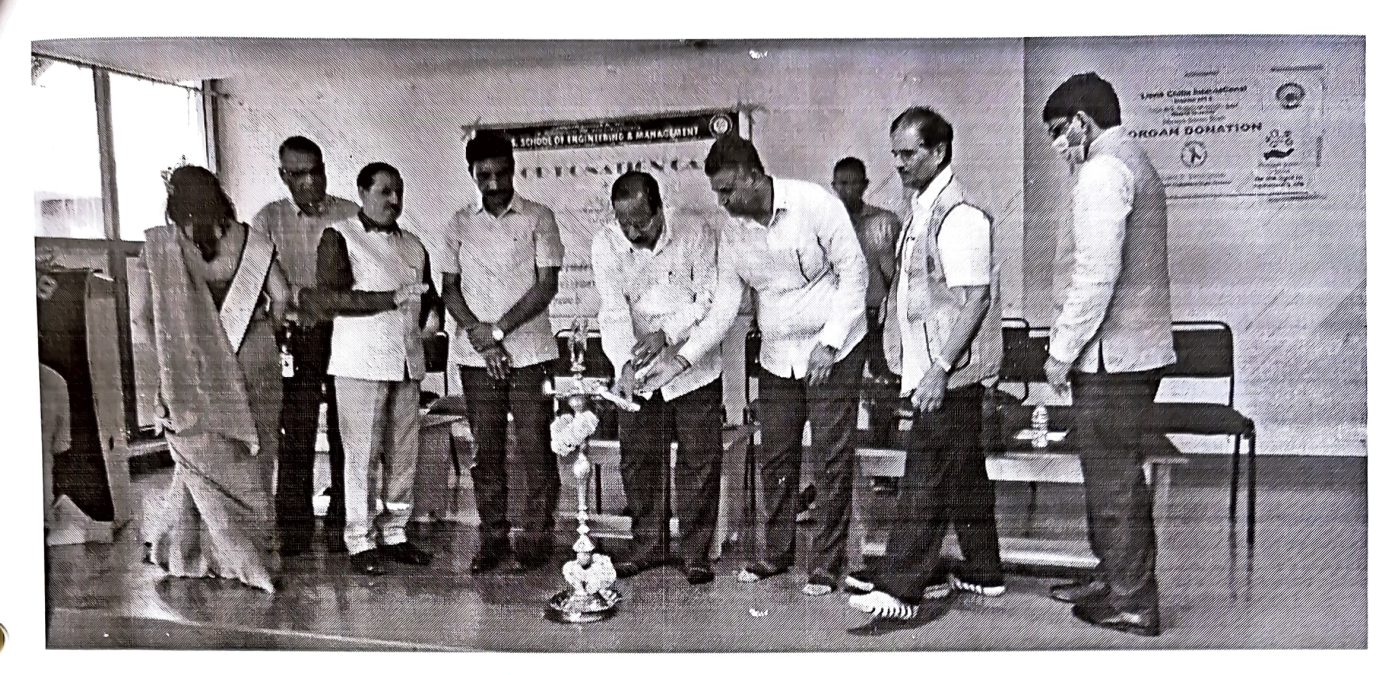
Figure 1: Lighting Lamp