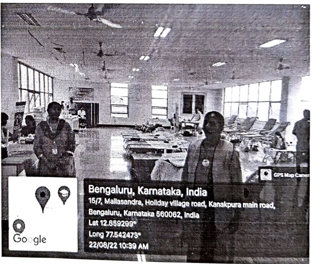
Figure 2: Arrangements