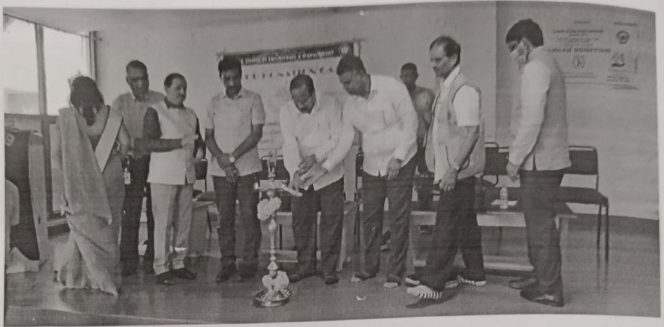
Figure 1: Lighting Lamp