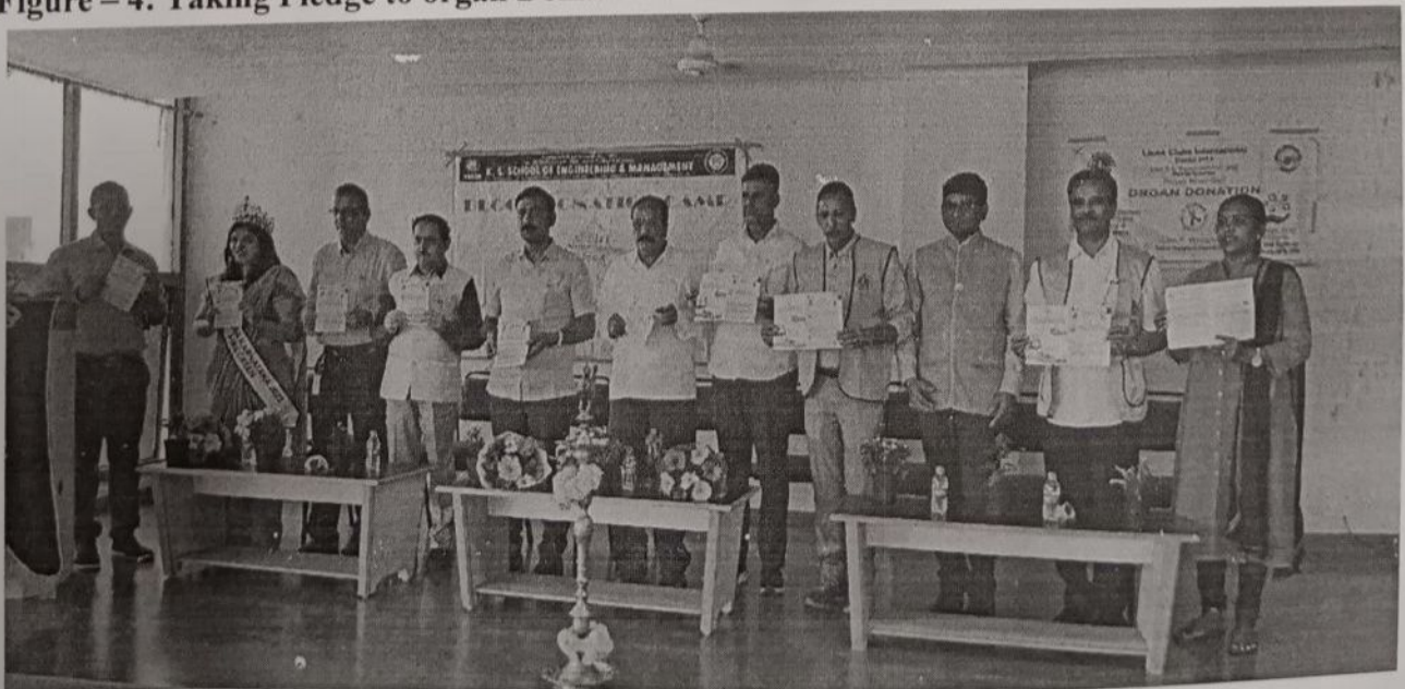
Figure – 4: Organ Donation Pledge.