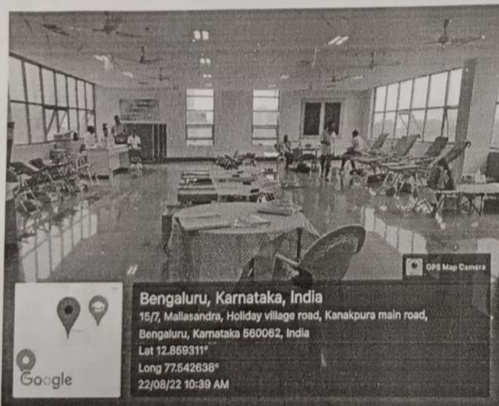
Figure – 2: Arrangements Done for blood donation.