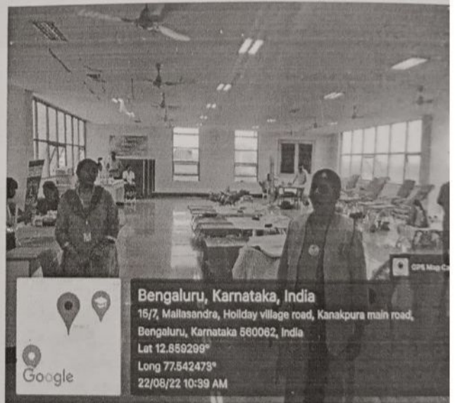
Figure 2: Arrangements