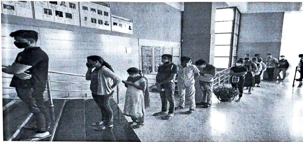
Figure 1: Making Line

Figure – 1: Shows that the students are making a line to take vaccination. We have taken all measures that sanitizing the rooms, temperature check and make them to follow social distancing etc.