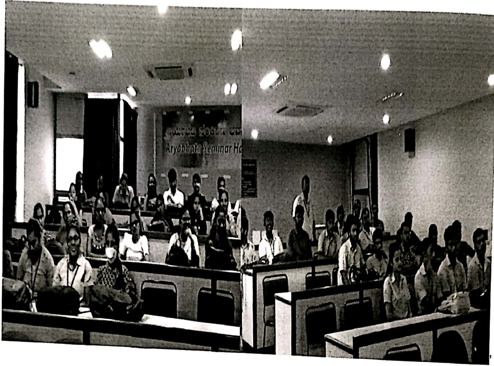
Fig: Interactive Session