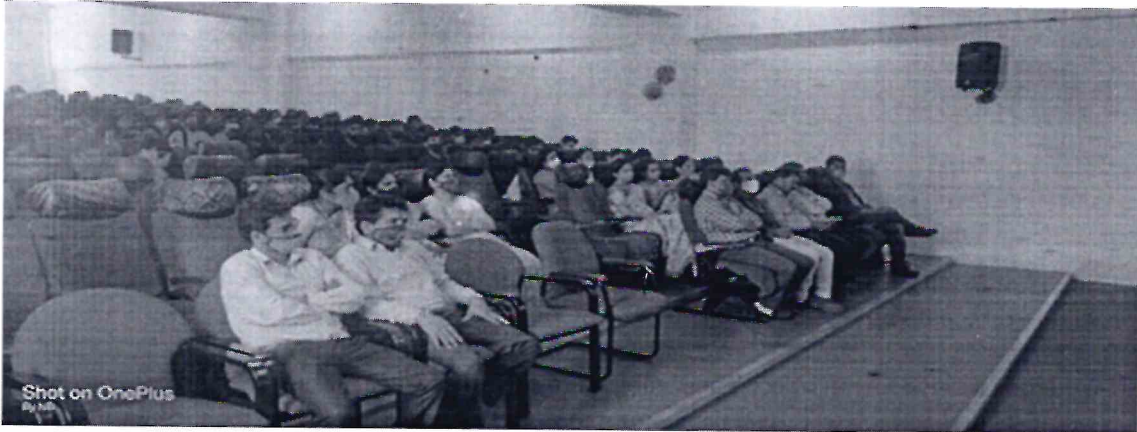
Faculties and students in the programme.

Lastly he explained about the scholarships provided and the process to get scholarships. Also, Quantum Learnings will be providing Letters required for future jobs or studying abroad on the requirement basis.